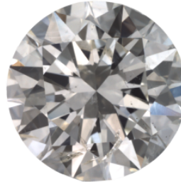
* Actual face up image, Not to scale Clarity grading scale