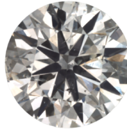
* Actual face up image, Not to scale Clarity grading scale