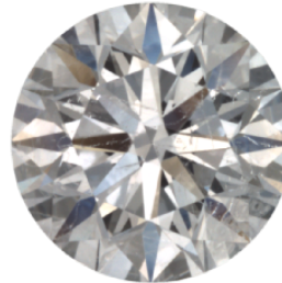
* Actual face up image, Not to scale Clarity grading scale