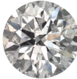
* Actual face up image, Not to scale Clarity grading scale