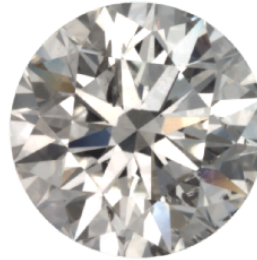
* Actual face up image, Not to scale Clarity grading scale