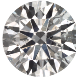
* Actual face up image, Not to scale Clarity grading scale