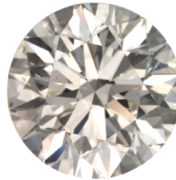
* Actual face up image, Not to scale Clarity grading scale