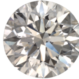
* Actual face up image, Not to scale Clarity grading scale