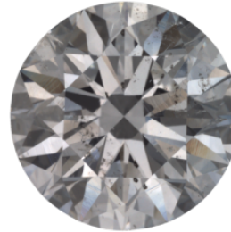
* Actual face up image, Not to scale Clarity grading scale