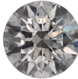
* Actual face up image, Not to scale Clarity grading scale