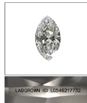
LASERSCRIBE SM Sample Image Used

Red symbols indicate internal characteristics. Green symbols indicate external characteristics.