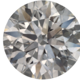
* Actual face up image, Not to scale Clarity grading scale