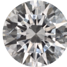
* Actual face up image, Not to scale Clarity grading scale