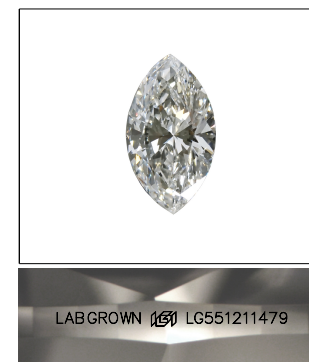
LASERSCRIBE SM Sample Image Used