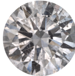
* Actual face up image, Not to scale Clarity grading scale