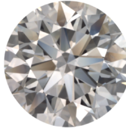
* Actual face up image, Not to scale Clarity grading scale