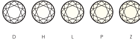
* Illustration and color rendering Color grading scale