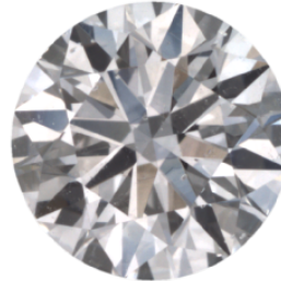
* Actual face up image, Not to scale Clarity grading scale