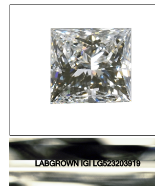
LASERSCRIBE SM Sample Image Used

Red symbols indicate internal characteristics. Green symbols indicate external characteristics.