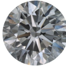
* Actual face up image, Not to scale Clarity grading scale