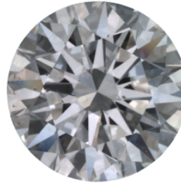
* Actual face up image, Not to scale Clarity grading scale